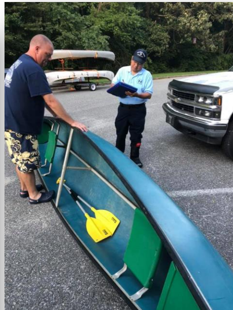
Fun on the Water